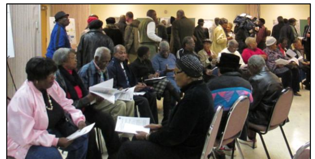
One of three second round Community Input Meetings held in December 2012

The project website www.i49shreveport.com supports an interactive map with the ability to display the four build alternatives presented in December 2012, the recently added NEPA-derived study area associated with Build Alternative 5, and various community features. An alignment for Build Alternative 5 will be added to the map once it is developed. Approved Stage 1 documents are added to the website as we move through the process. Additionally, the Stage 0 document and issues of Stage 0 newsletters, Volume 1, can be found on the project's website. Please visit the website often for the most up to date information, to be added to mailing lists, and/or to leave your comments.